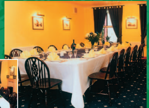
The Flying Boat Room