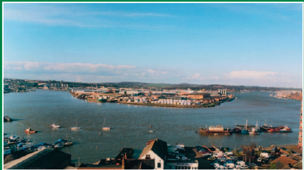
This fantastic view of the River Medway was taken from one of our guest bedrooms.

The St. George Hotel prides itself on a warm and friendly welcome every time.