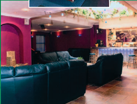
Lounge Bar and Reception Area