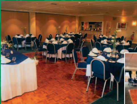
Banqueting Hall and Stirling Room

Ideally situated, the St. George Hotel is close to Historic Rochester and Chatham Town Centre as well as Chatham Historic Dockyard, M2/M20/M25, Bluewater Shopping Centre and Ports.