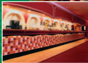
Stanley House Ballroom