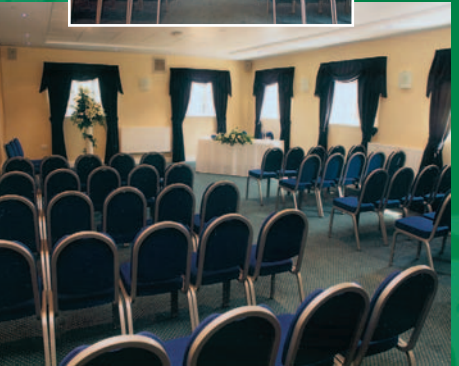
Marriage Room for Civil Ceremonies